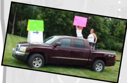
The youth attempting to get customers at the recent ONE car wash.

Prizes can be picked up in the back of the Youth Center. Please note: Participants who collected $80 and up are eligible to receive rewards.