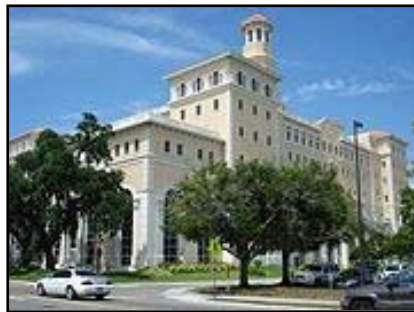
The Super Power Building of the FLAG Scientology complex in Clearwater, Fla. is still under construction.

http://en.wikipedia.org/wiki/Scientology